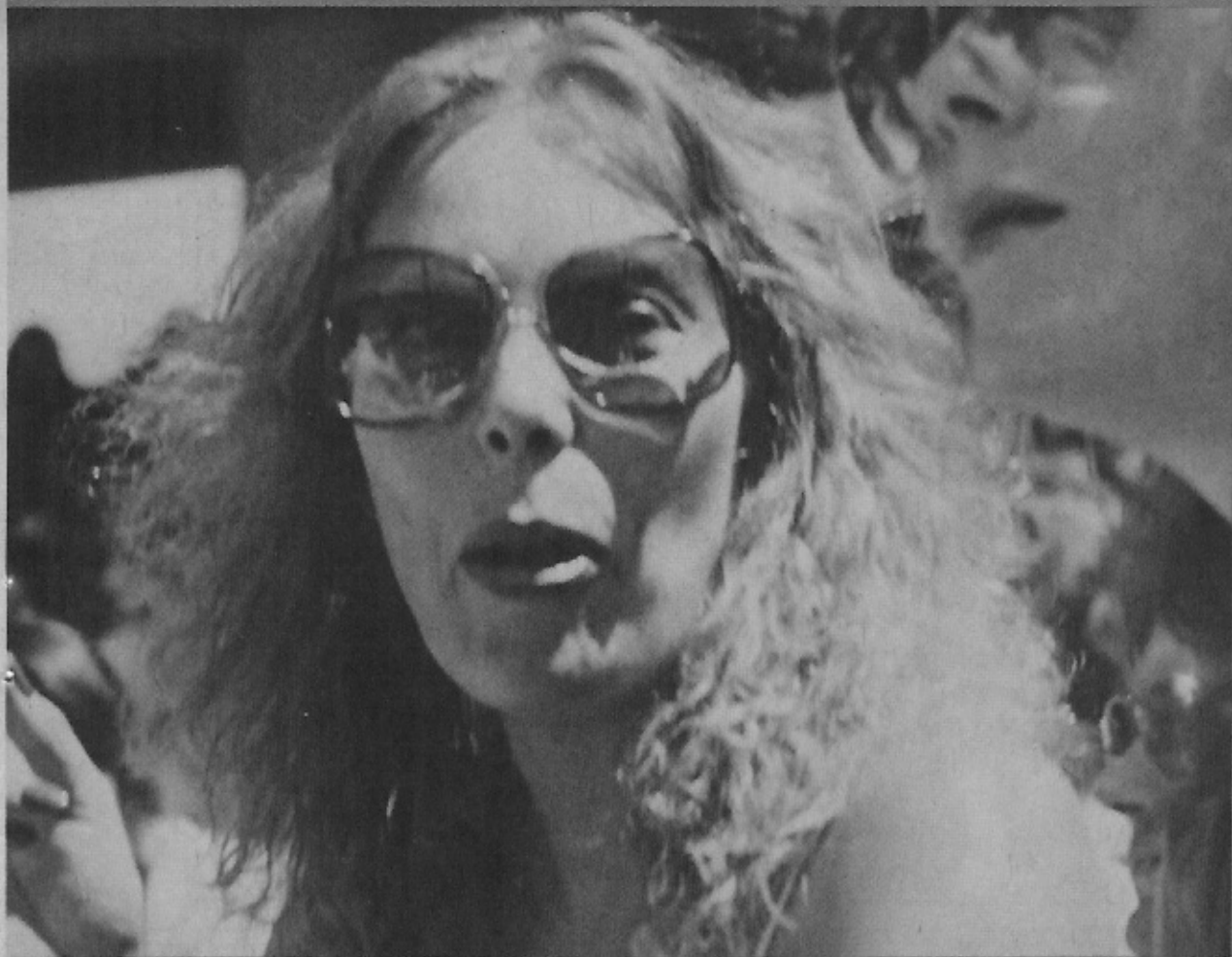
Is That Joni Mitchell rooting for the home team?? (You bet it is!)