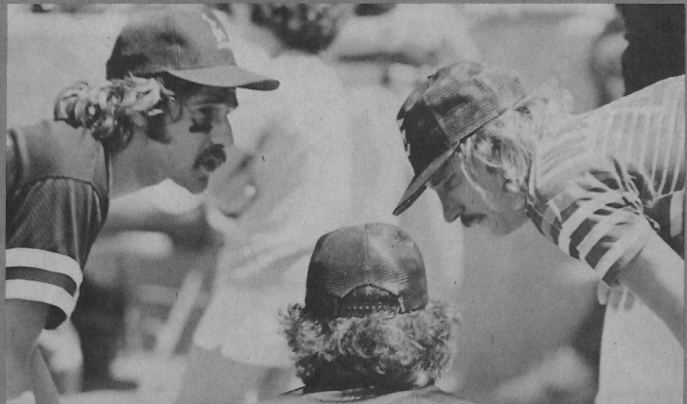
"O.K. guys, this is the plan . . ."