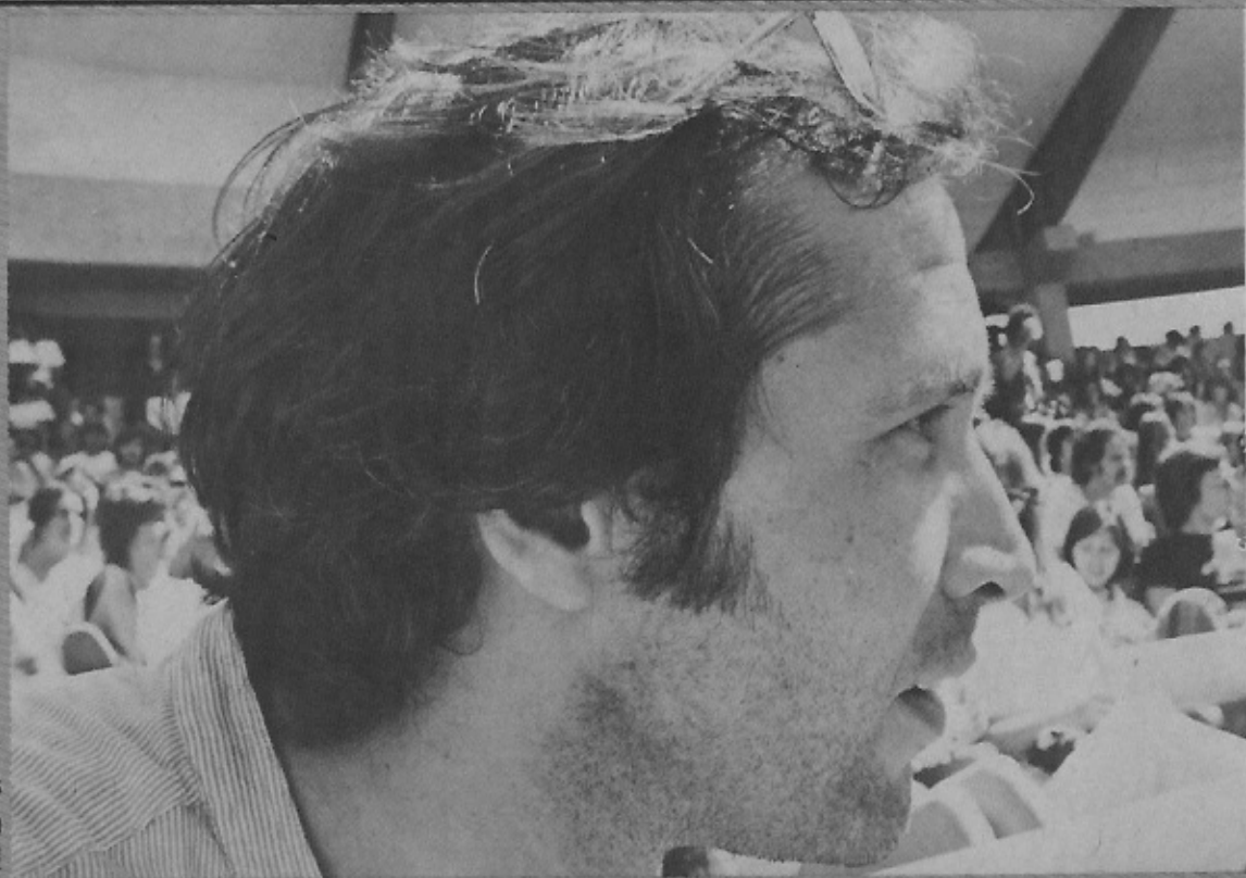
Chevy Chase watches the action with eager eyes!